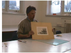
Figure 2. A 19 th Century print with backing.