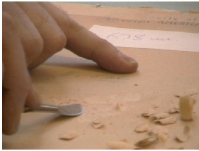
Figure 1. A backing removal in progress.

In paper conservation training, students are often required to gain many hours of experience in specific manual tasks. This is necessary to acquire the skills for the successful and safe treatment of delicate and fragile works of art. The haptic virtual reality (VR) environment offers a means of creating an enhanced training tool for conservators. Simulated conservation operations, such as backing removal, can be performed without risk to the objects, while building skills. Training can be accelerated through enhanced performance feedback using visual, aural and touch stimuli. The simulation software can also track the student's progress by compiling statistical data on their performance that can be reviewed by the tutor.