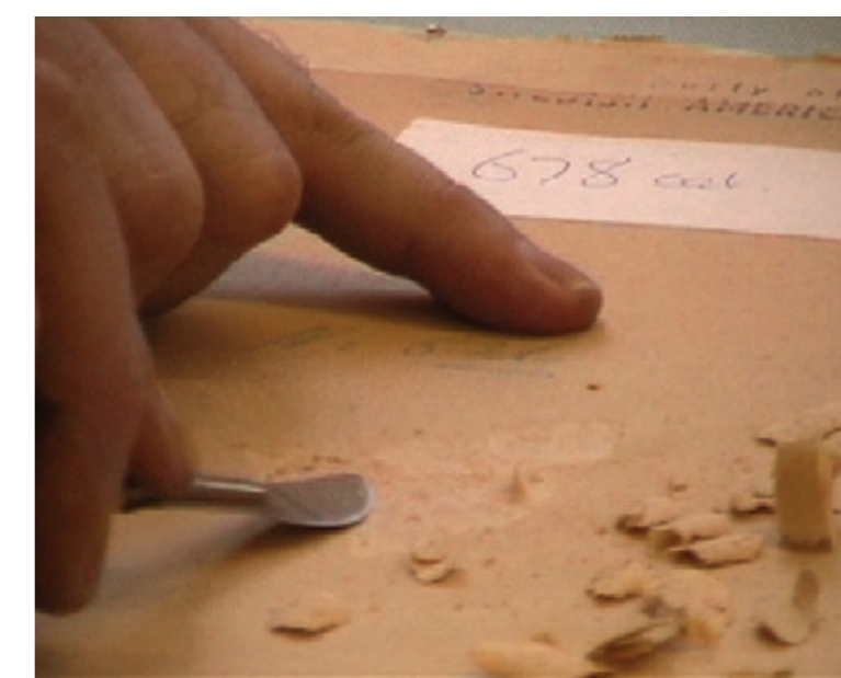
Fig. 1a-1c (left to right). A scalpel backing removal of from paper in progress. The time available in a typical conservation degree course is limited. This often means that students begin by training on genuine works of art. The extended period usually needed for students to master backing removal treatments may be shortened by the use of the simulation based training.

two additional classes were created in C++, extending the standard API libraries. The simulation environment scene, including geometry and interface components, was created with Virtual Reality Modelling Language (VRML) and Python.